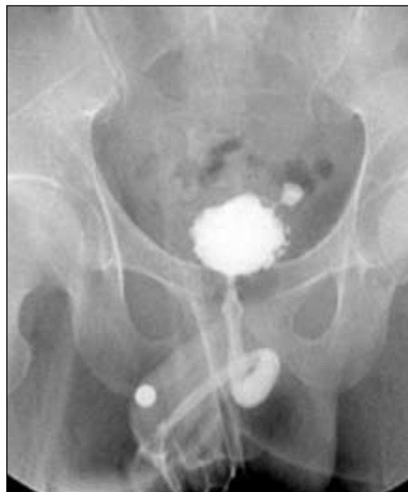
FIG 2. Video-urodynamic study of patient 2 with markedly contracted and trabeculated bladder

of hydronephrosis in most, and renal impairment in half, of our patients is suggestive of a progressive disease process that might end up as chronic renal failure. The aetiology of this disease is presently