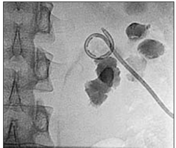
FIG 5. Left antegrade nephrostogram of patient 2 showing markedly diminished flow of contrast in the left ureter all the way to below the pelvic-ureteric junction