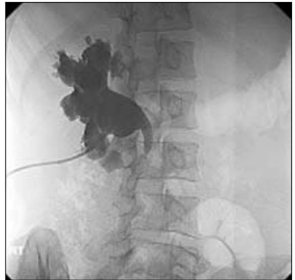
FIG 4. Right antegrade nephrostogram of patient 2 showing complete obstruction just below the pelvic-ureteric junction level