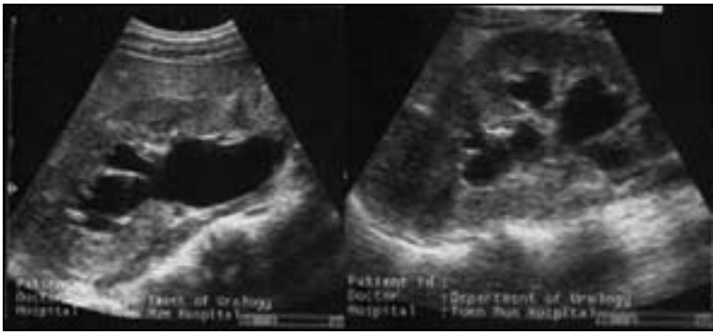
FIG 3. Ultrasound kidneys of patient 5 showing bilateral hydronephrosis

unknown. We initially postulated that damage to neurons in the brain or the spinal cord was the cause of the bladder dysfunction. Nonetheless, patient 2's pathology—bilateral ureteric strictures, suggestive of retroperitoneal fibrosis—implies that another aetiology like an intensive immunological response to 'street ketamine' may be a contributing factor. Possible causes include the direct toxic effect of ketamine and its metabolites on the lower urinary tract mucosa. Ketamine abusers are likely to be exposed to other drugs and chemicals either purposefully added as a cutting agent or being co-abused in a soft drug cocktail. 10 One sample of snorting ketamine powder was obtained from one of our patients and analysed but this failed to identify any additional ingredient likely to cause the bladder dysfunction. Further investigation is needed to determine the exact cause of the pathology. An epidemiological study would be helpful for assessing the actual size of the problem and may yield clues to the aetiology as well. The authors would like to alert frontline doctors, especially those working in primary care, emergency departments, and psychiatry, to this new form of uropathy and its association with ketamine abuse. Early urology referral for comprehensive investigation and management would help combat this new form of urinary tract disease.